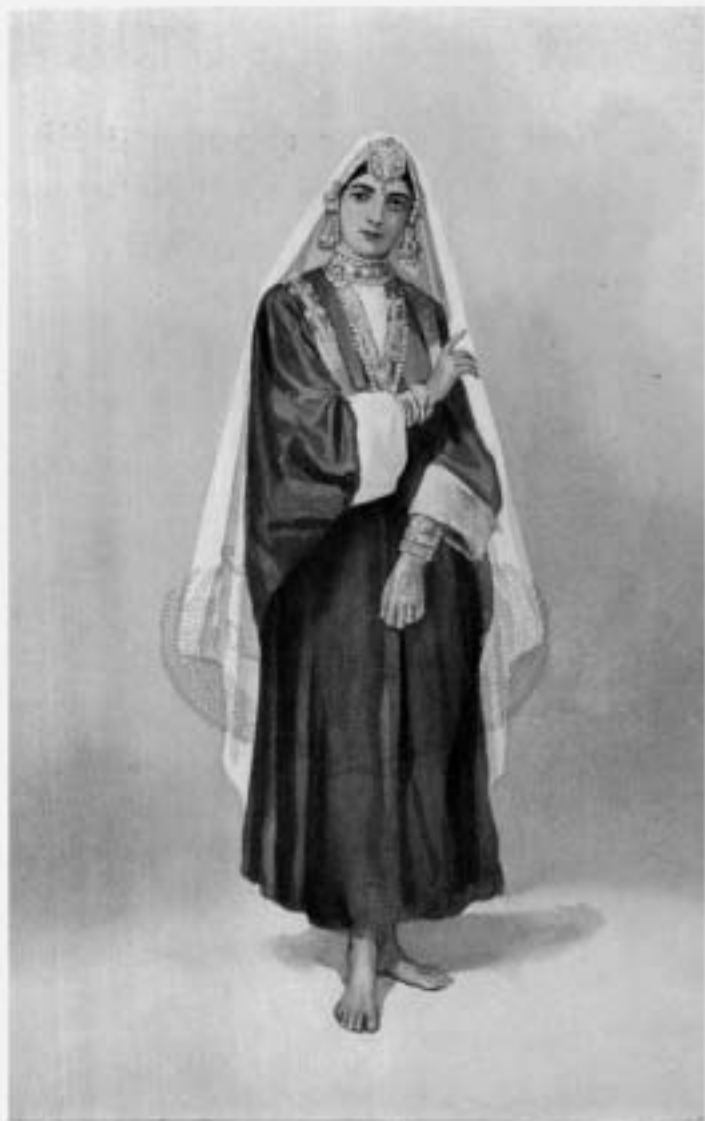
IN-THE HAPPY VALLEY OF KASHMIR